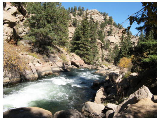
The Colorado River